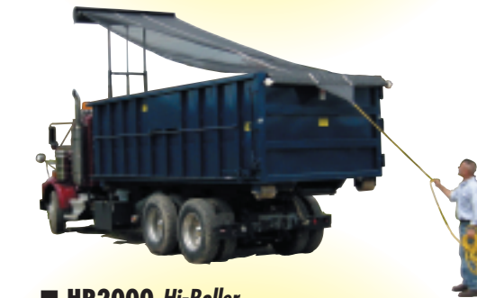
■ HR2000 Hi-Roller