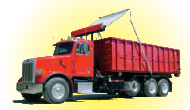
■ HR1500PTO EconoCover II