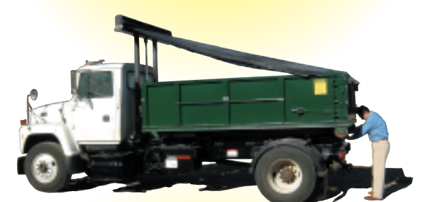
■ HR1000 Tuff-Tarper